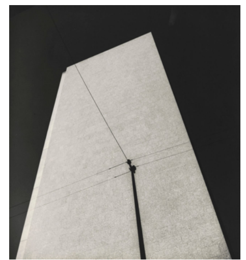
Thomaz Farkas 'Ministry of Education (Ministerio da Educacao) [Rio de Janeiro]' (c. 1945)