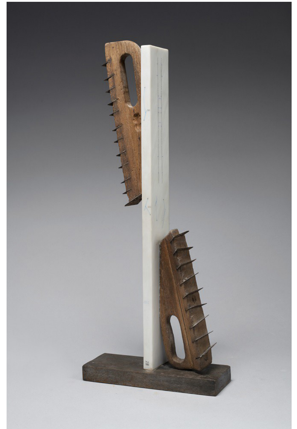
Untitled, 1990 Drawing and mixed media on marble 20 13/16 x 2 5/16 x 7 1/16 in. (53 x 6 x 18 cm.)