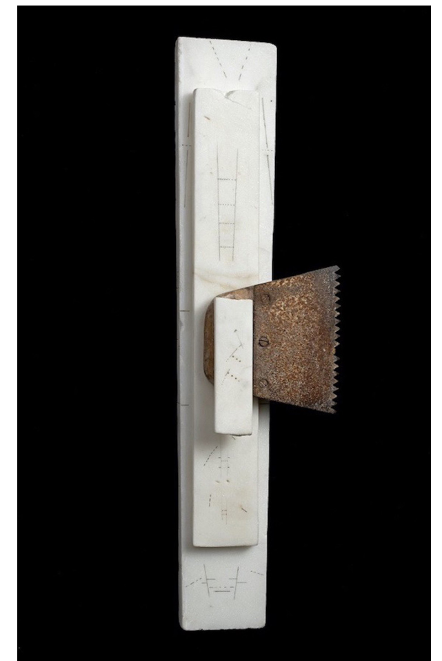
Untitled , 1991 Drawing and mixed media on marble 14 15/16 × 4 5/16 × 2 3/4 in. (38 × 11 × 7 cm.)