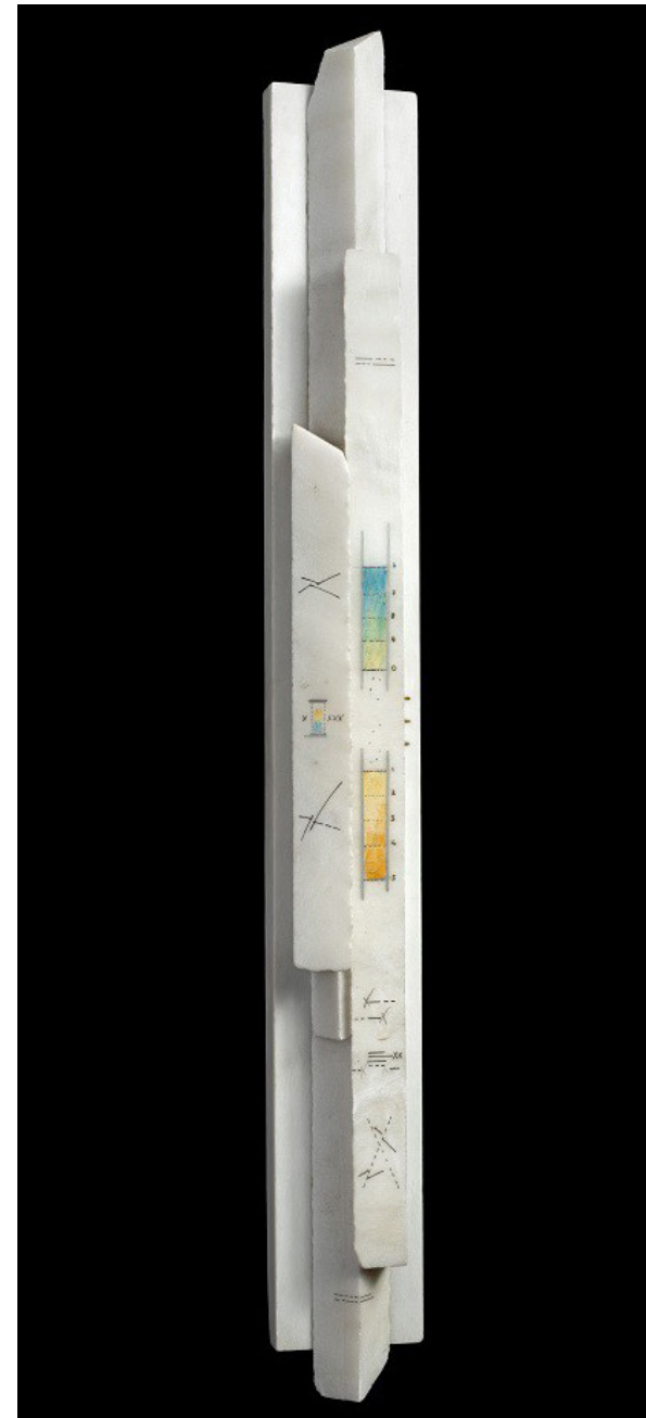
Untitled , 1990 Drawing and paint on marble 22 × 2 5/16 × 2 5/16 in. (56 × 6 × 6 cm.)