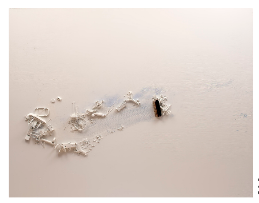
Red Brush, 2019 Acrylic and assemblage on canvas 60 x 72 x 5 1/2 in.

White in her paintings has traditionally has been applied flat onto her canvases. Yet within her recent artworks depicting what she refers to as tsunamis or other chaotic environmental disasters, the Minimalist flatness of her white surfaces has given way to looser applications of white paint, which wash over and envelope miniature objects, as in Red Brush from 2019. Oddly as the white paint in this work becomes more active in a painterly manner, it concurrently holds representational references, recalling coverings of snow or white waves. The red brush that is the subject of the painting is displayed as involved in a process of trying to clean or make order out the chaos represented, by sweeping the fallen objects to one side. This movement creates a large gestural mark that particularly nods to Abstract Expressionist ways of applying paint. The brush has a velvetcovered handle, which catches the light and adds to the strong tactile guality of the entire piece. The ruby-red of this found object contrasts with the cool white around it, in a manner similar to strategies seen in older works by the artist. What is distinct and notable is Porter's inclusion of washes of pale blue paint placed on top of