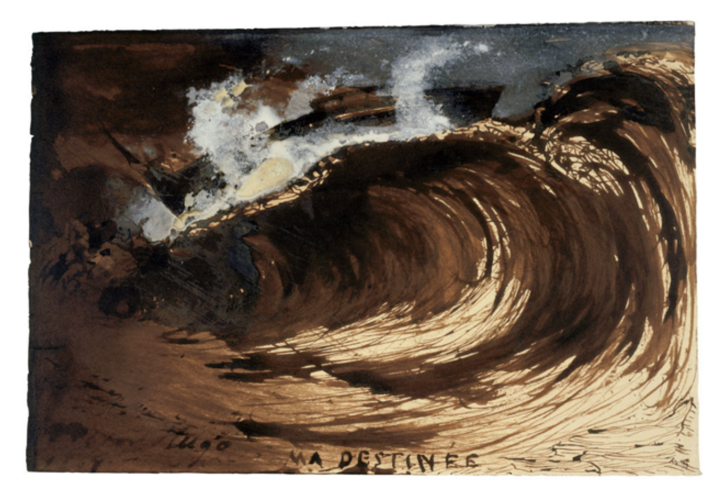
"Ma Destinée," one of the moody examples in "Stones to Stains: The Drawings of Victor Hugo," opening at the Hammer Museum in Los Angeles in September.

NEW WORK: ETEL ADNAN This Beirut-born painter's pocket-size landscapes, serenely pieced together in broad strokes of mildly tropical color, don't so much straddle the line between abstraction and figuration as dissolve it with love. Sept. 1-Jan. 6, San Francisco Museum of Modern Art, sfmoma.org.