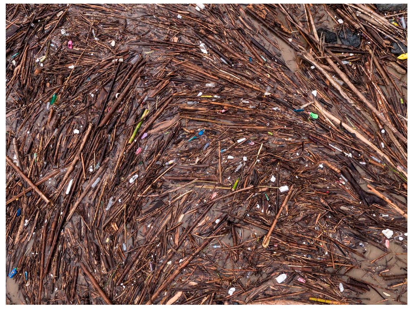
Clemencia Echeverri. Rio por asalto. 2018. Video installation.