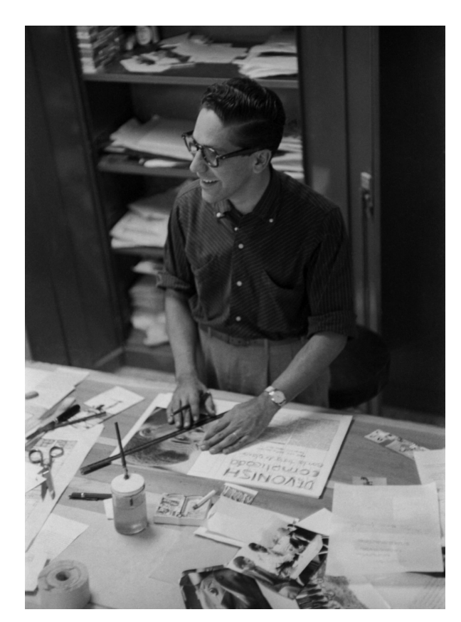
Carlos Cruz-Diez in his design studio. From the magazine Momento, Caracas, 1957.

Extensive study and introspection led to his realization that, in the art of his time, color still awaited a solution that would make manifest its changing and luminous nature.