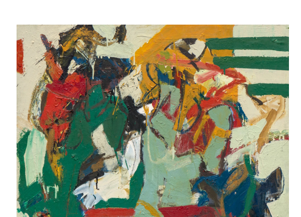
Wook-kyung Choi, Untitled, 1960s Acrylic on canvas, 101 x 86 cm © Wook-kyung Choi Estate and courtesy to Arte Collectum