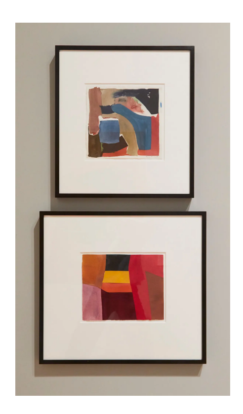
Fanny Sanín's pictures "Watercolor No. 4 (2)" (1968), top, and "Watercolor No. 8" (1968), bottom.