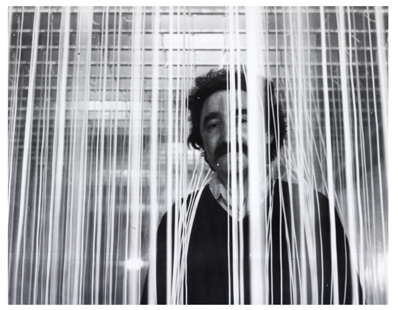
Jesús Rafael Soto in the Petit pénétrable, 1969, solo exhibition Soto, Galerija Suvremene Umjetnosti, Zagreb, Yugoslavia, June–July 1970

Fascinated with cubism and constructivism (Braque, Mondrian, and Malevich, especially), which he knew only through reproductions, in 1950 he relocated to Paris—a hub of artistic experimentation and a mecca for Latin American artists.