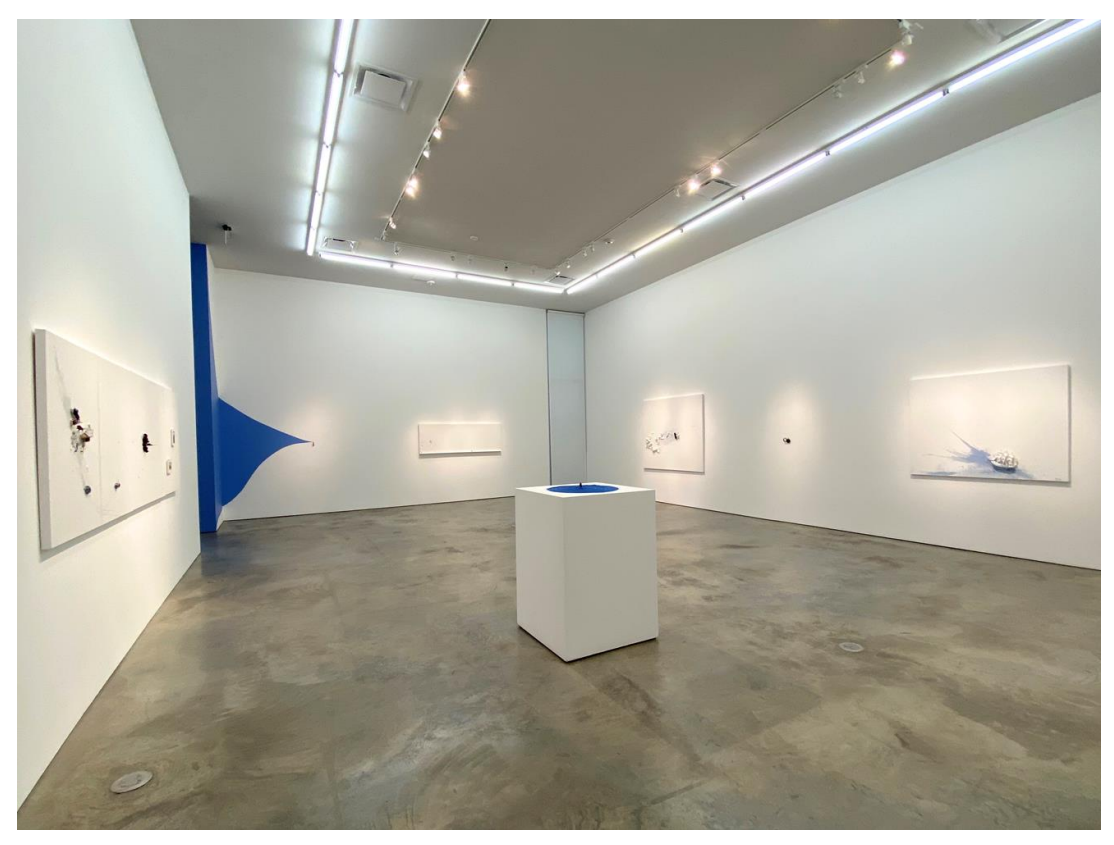
In stall ation \ view \ of \ Porter's \ 2020 \ "Red \ Brush \ and \ Other \ Situations" \ exhibition \ at \ Sicardi \ | \ Ayers \ | \ Bacino.

<u>Red Brush and Other Situations</u> is on view at Sicardi | Ayers | Bacino through May 16, 2020. Here are a few ways to experience the exhibition from home: