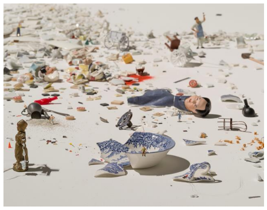
Man with Axe, 2017 (detail)