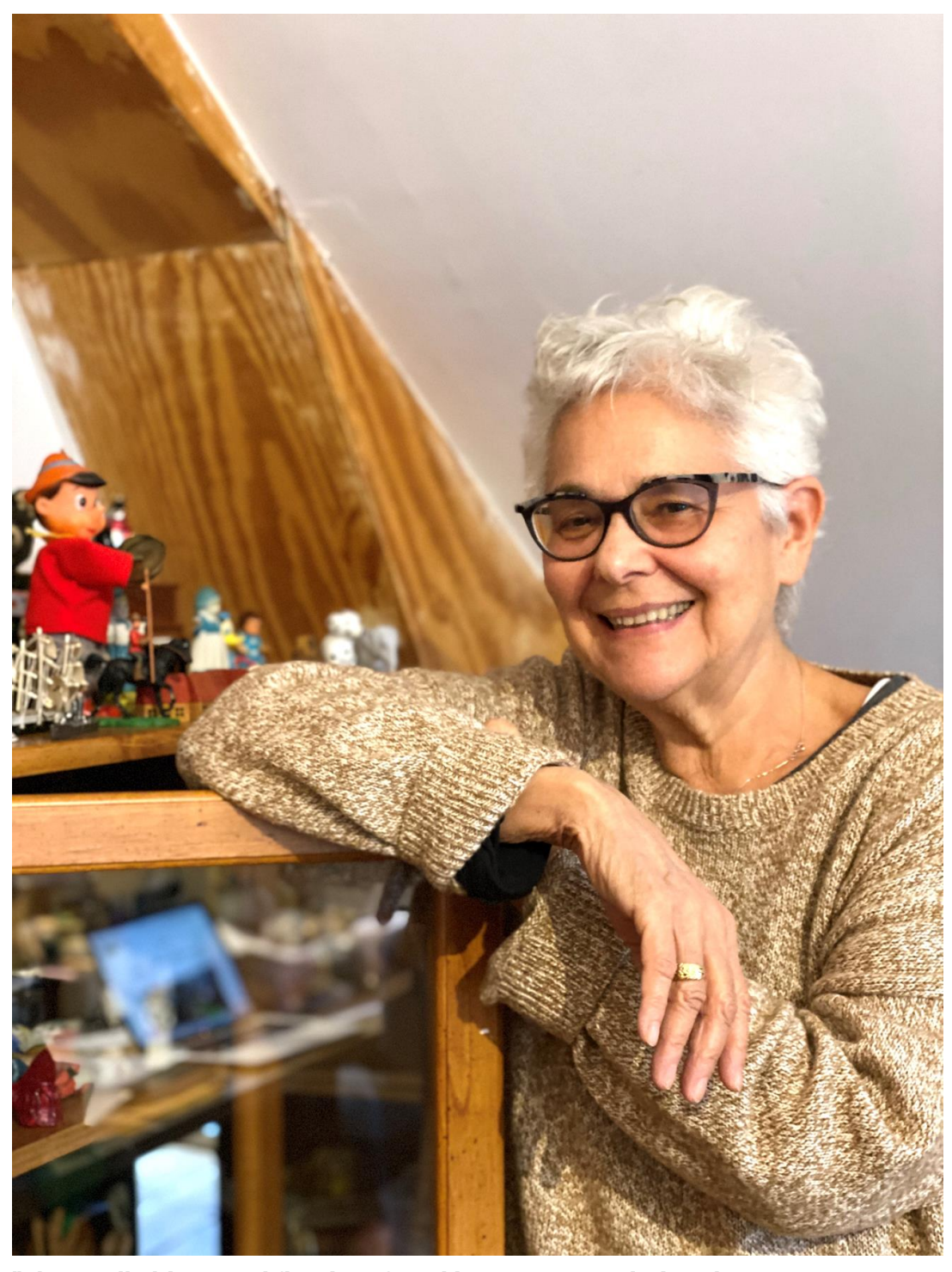
"The small objects and figurines found in my recent paintings become