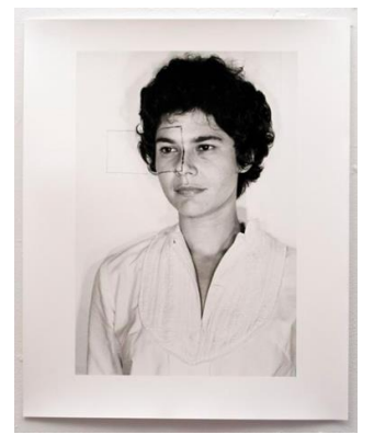
Liliana Porter. Self Portrait with Square II, 1973/2014.