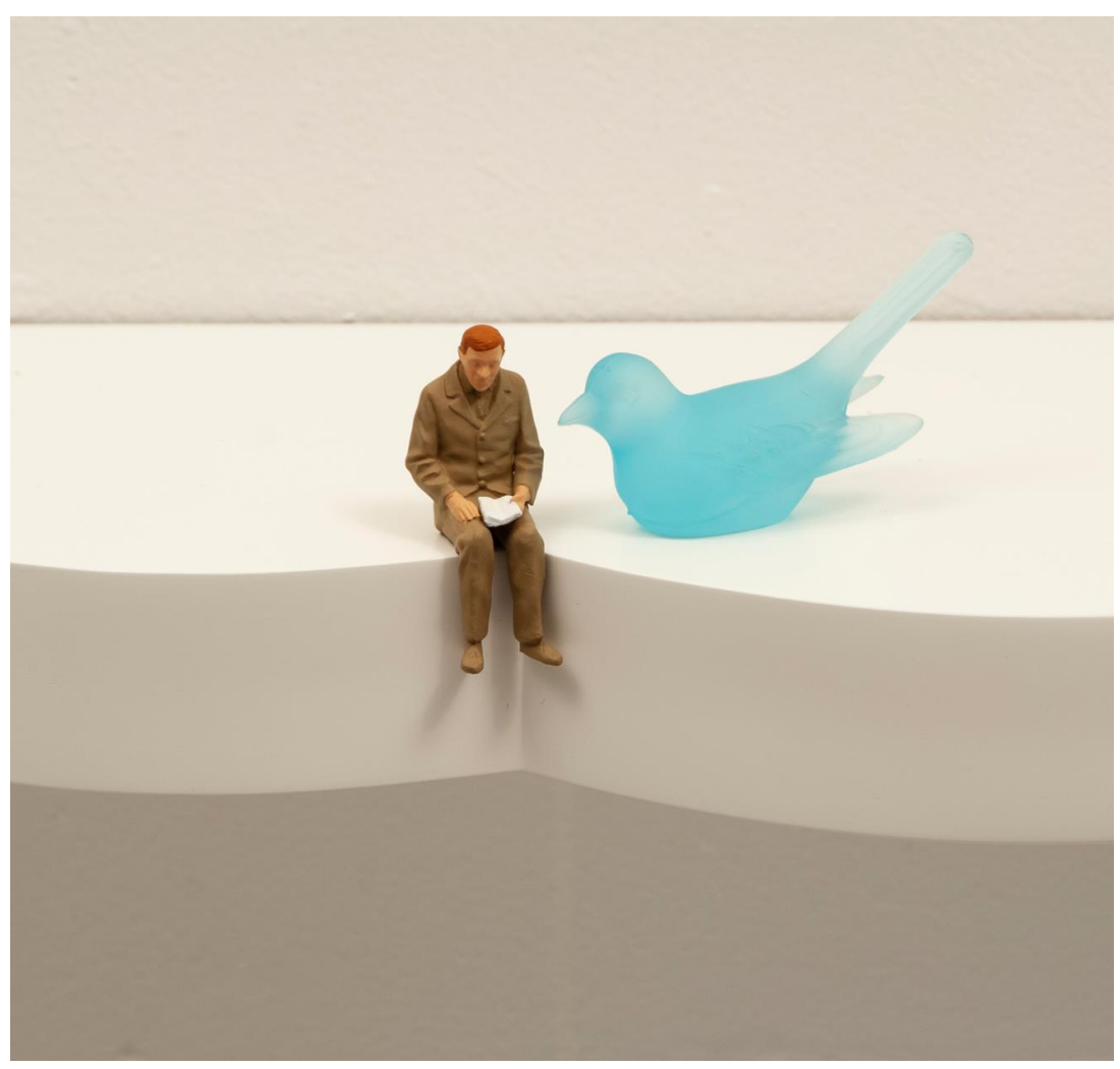
Liliana Porter, To Read, 2019. Glass bird and resin figurine on shelf, 43 x 10 1/2 x 4 in.

A native of Buenos Aires, <u>Liliana Porter</u> relocated to New York in 1964. In 1965, she co-founded the New York Graphic Workshop, which produced prints while redefining conventional models for making and distributing art. Porter's work often places carefully chosen small figurines and other objects in monochromatic empty backgrounds, addressing larger philosophical questions and emotional states. Alongside printmaking, she has also worked extensively in the media of photography and video, and has created works on canvas, drawings, collages, installations, and theatrical performances.