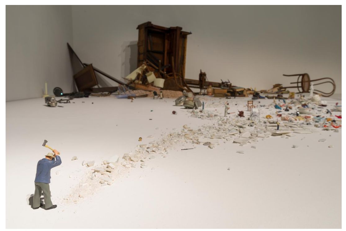
Man with Axe, 2017, is a site-specific installation created for the 57th Venice Biennale, and later acquired by the Pérez Art Museum Miami (PAMM).