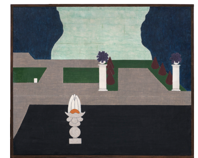
Eleonore Koch Untitled, 1981 Tempera on canvas 35 × 42 1/8 in.